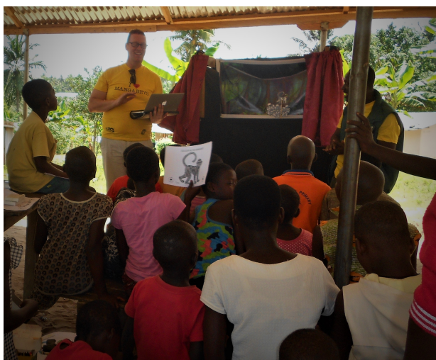
WAPCA Team engaging the kids of a local community during MAD 2018